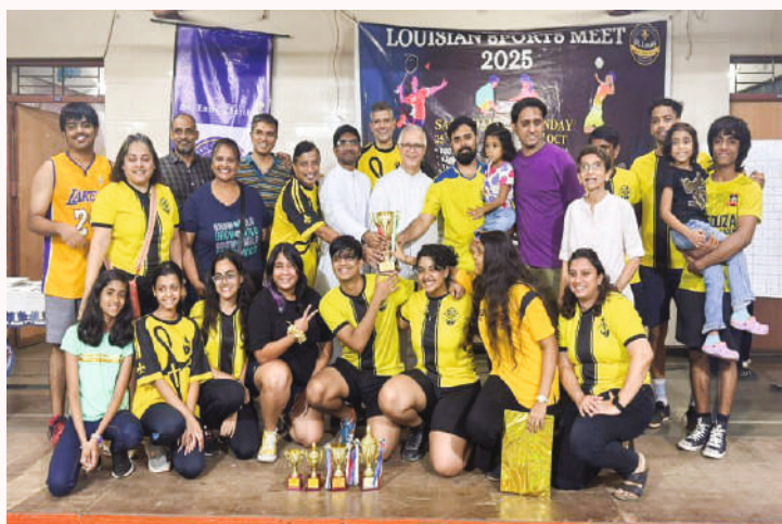
Overall Winners - Holy Family Community