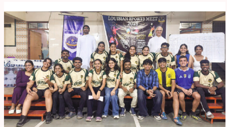
Organising Committee - Parish Youth Group