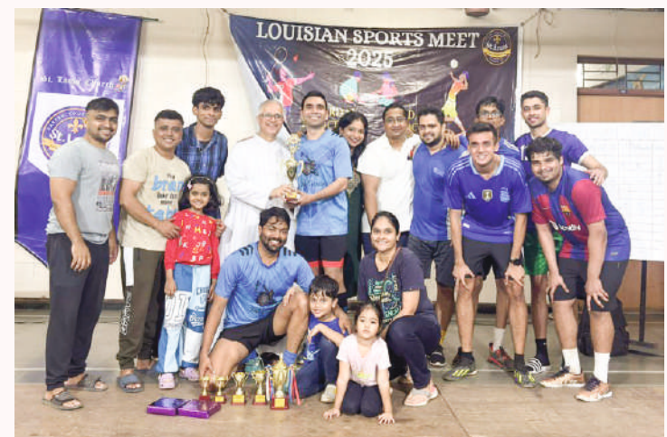
Runners Up - Holy Trinity Community