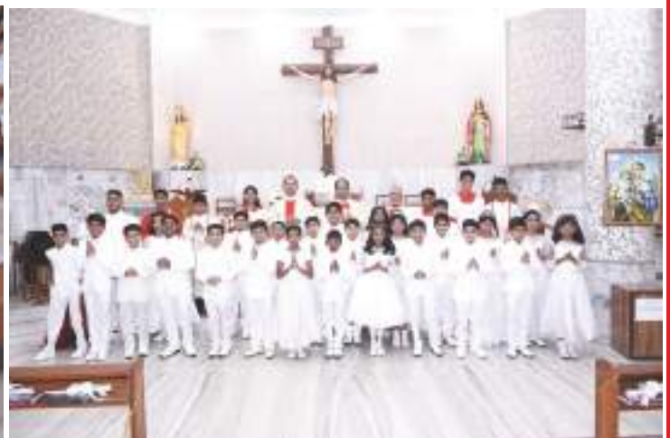
First Holy Communion Batch of 2025