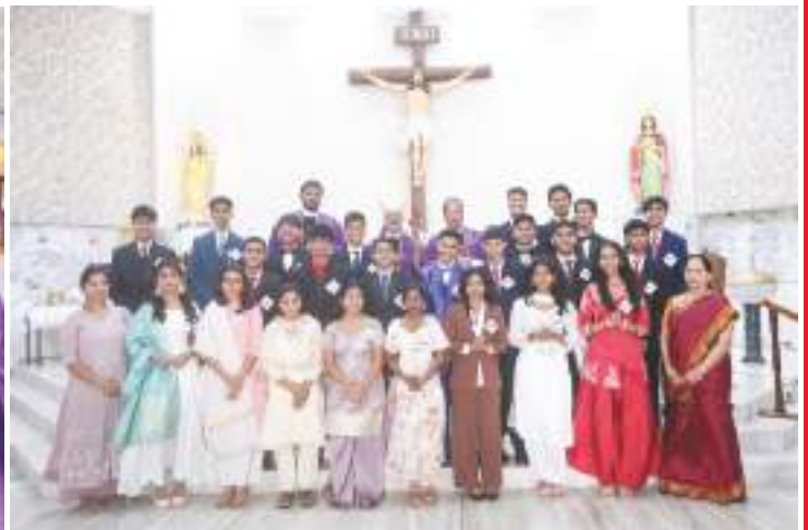
Confirmation Batch of 2025